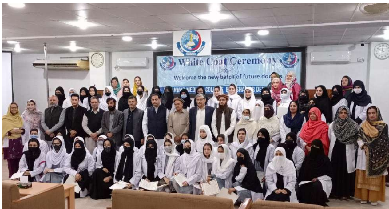
1 st Year BDS Students of PDC in a group photo with the Faculty Members.

The newly enrolled 1st year BDS students joined Peshawar Dental College on February 20th, 2023. After initial orientation and visits to Peshawar Dental and Peshawar Medical Colleges and their affiliated teaching hospitals, the white coat ceremony of the students was conducted on Wednesday, February 22, 2023, at the PMC auditorium.