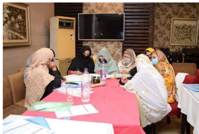
Activities during the workshop.