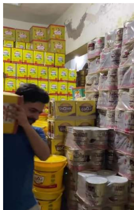
The volunteers of SWS packing edible items for distribution among needy people.