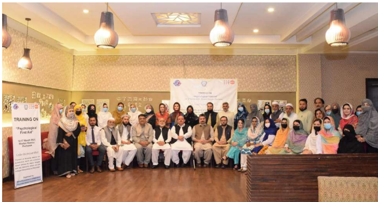
Participants of the workshop posing for a group photo.

Prime Foundation, in collaboration with UNFPA, is implementing a reproductive health (RH) project in Khyber Pakhtunkhwa, which is being implemented in various facilities in the region. As part of the project, a four-day training program on "Psychological First Aid" was conducted from 14-17 March 2023 in Peshawar.