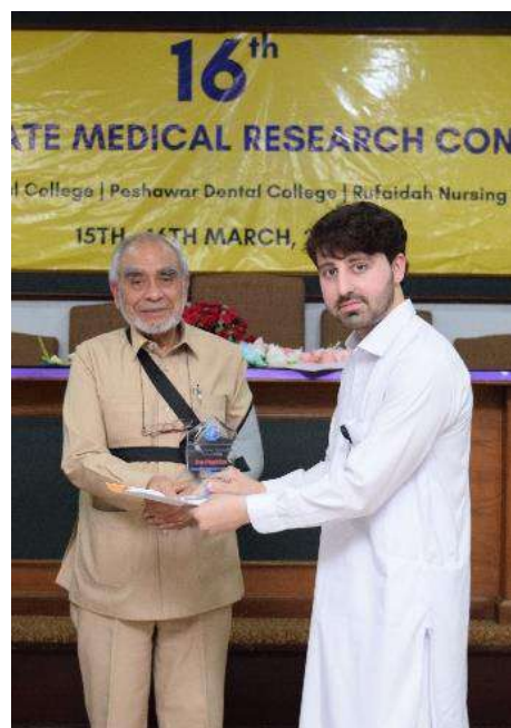
Participants of workshop "Research a Solo career vs as part of a medical career".