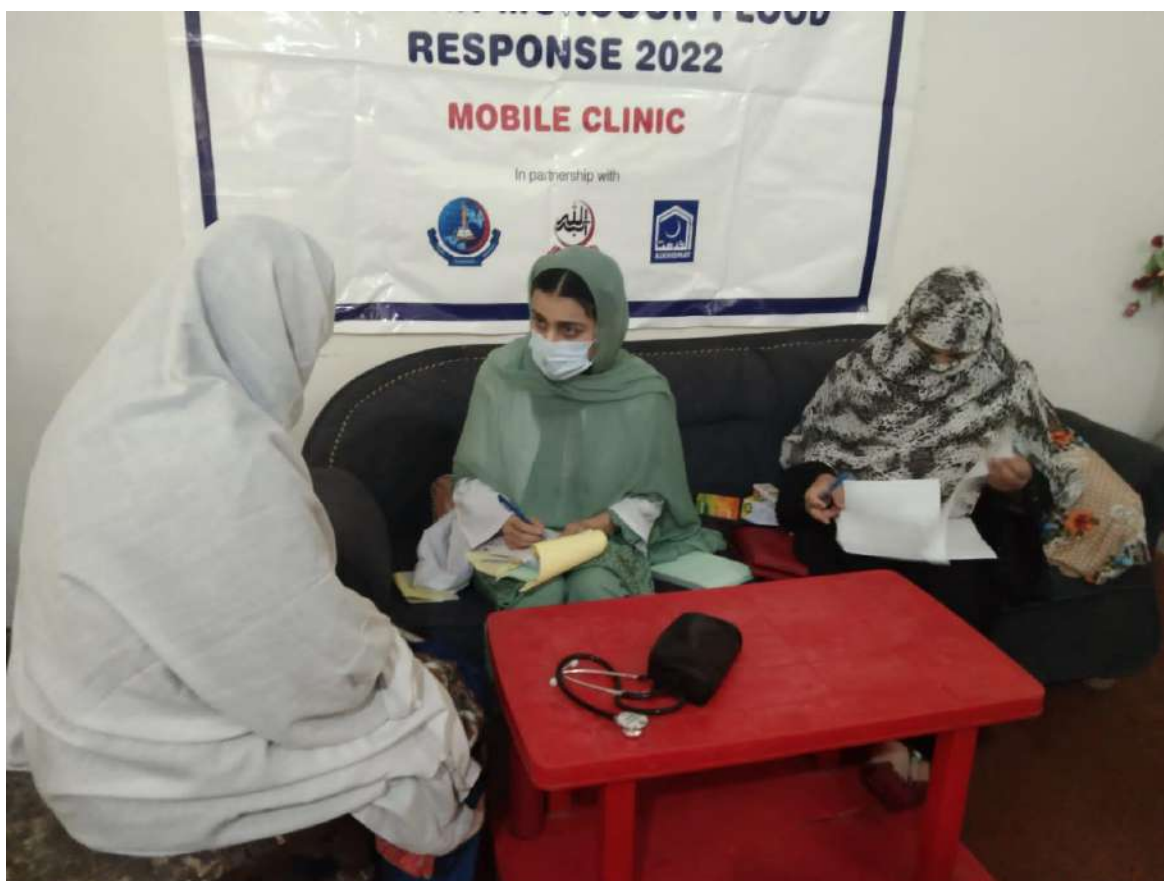
A lady doctor examines a female patient at a mobile camp.

In Collaboration with Pakistan Medical Association (PIMA) and Alkhidmat Foundation, Prime Foundation arranged free medical relief camps and awareness sessions in different flood-affected areas of Khyber Pakhtunkhwa during last year's devastating floods. In these camps, 5550 flood-affected patients from various areas of the province were provided medical relief on purely humanitarian grounds.