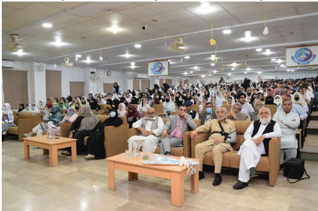
Participants of the UMR conference 2023.

proper relationship with science to utilize it for the betterment of humanity. He stressed the need for proper attention to public health to solve our problems. The chief guest underlined the need for collaboration among research institutions to strengthen their research activities and get better results.