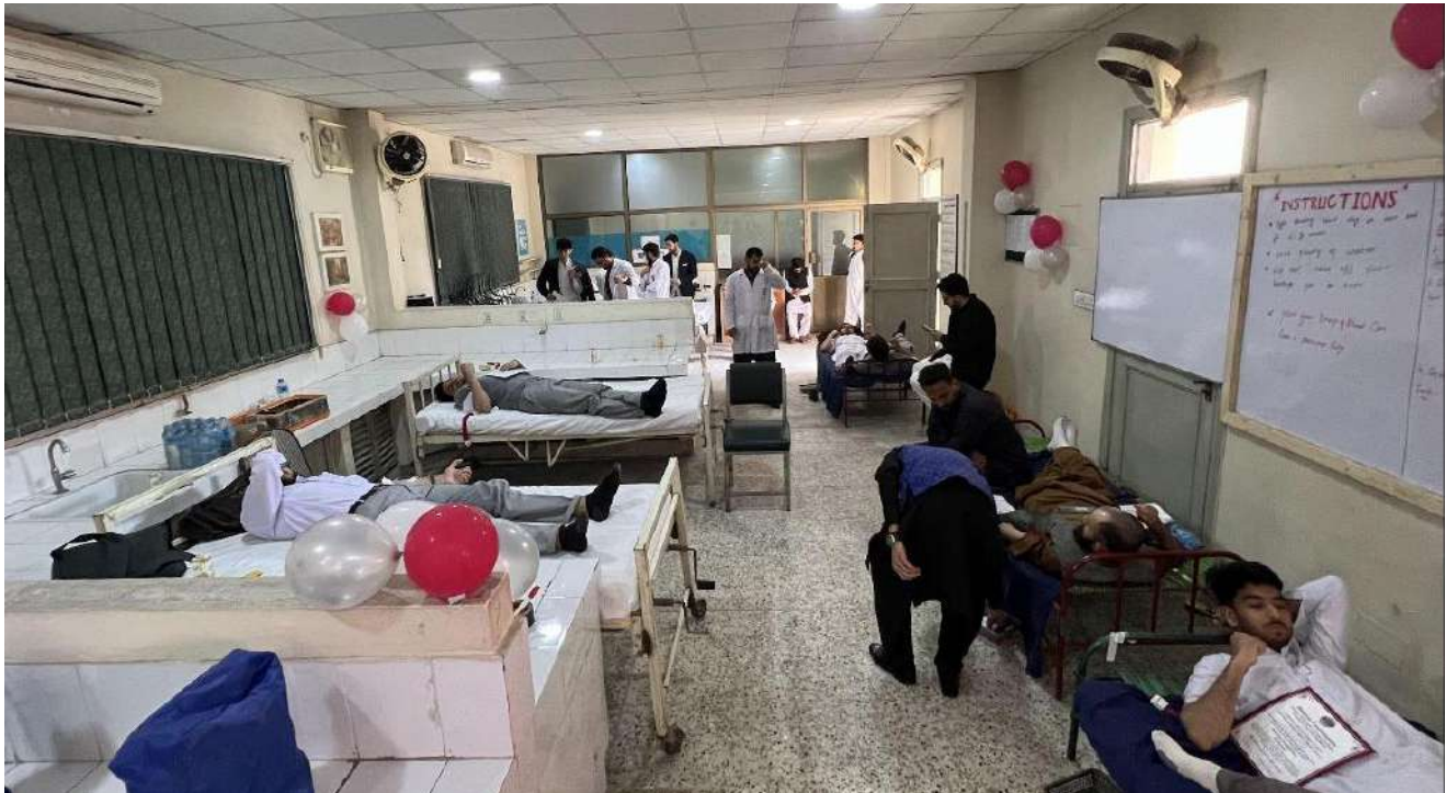
Volunteers donating blood.

Social Welfare Society (SWS), Peshawar Medical College (PMC) and Peshawar Dental College in collaboration with Hamza Foundation organized a blood donation camp at PMC. Students of these institutions donated 115 pints of blood to facilitate helpless patients suffering from various diseases. The SWS also collected Rs. 68,000 rupees for the deserving patients.