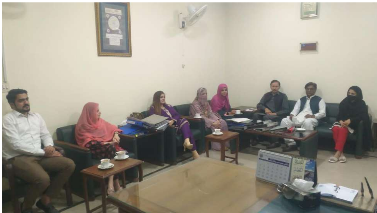
HERA Team visited PDC.