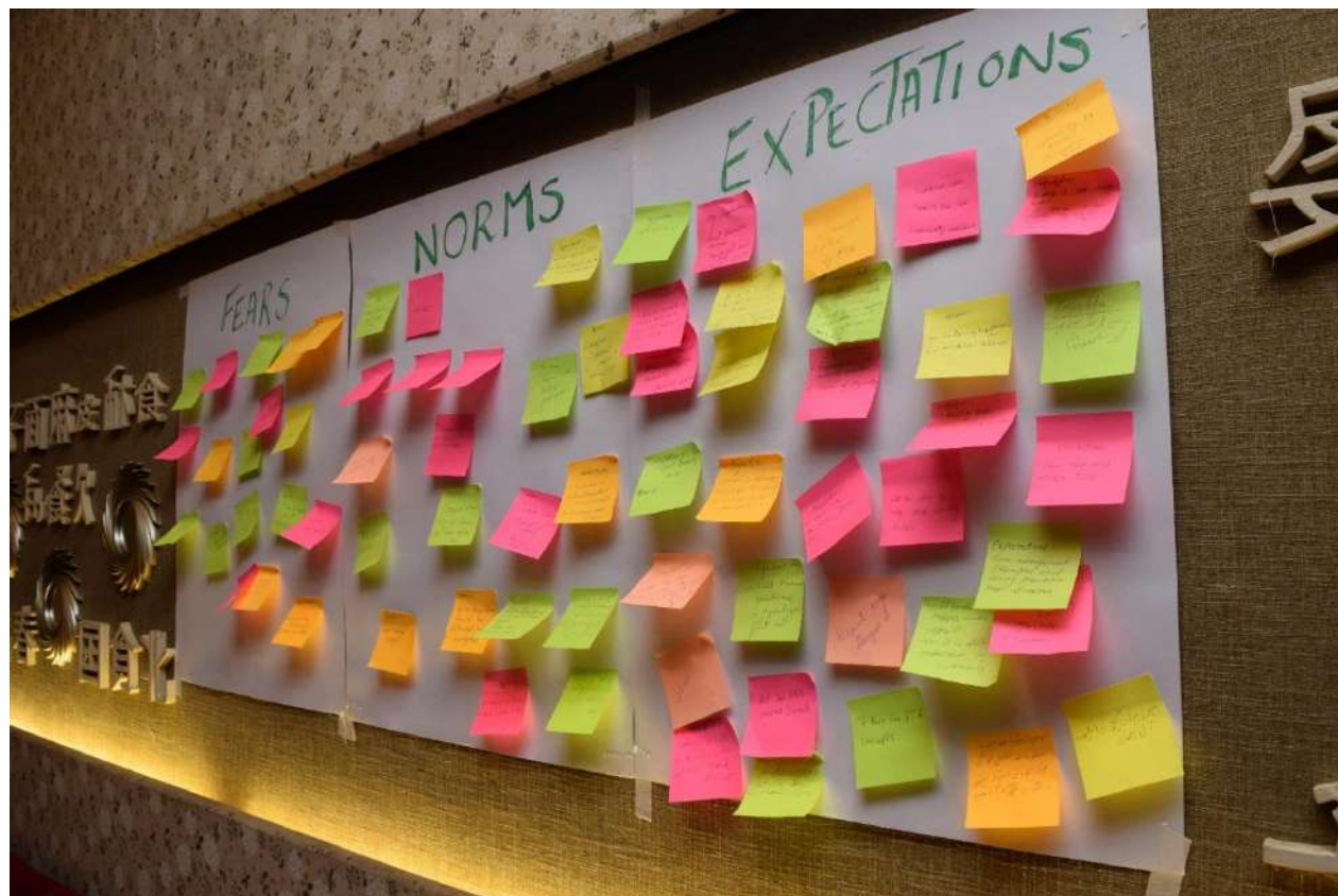
Activities during the workshop.

Overall, the four-day training program on "Psychological First Aid" was an essential component of the RH project implemented by Prime Foundation and UNFPA in Khyber Pakhtunkhwa. It would help the staff to respond effectively to the mental health needs of the project beneficiaries, and ensure that they received appropriate care and support.