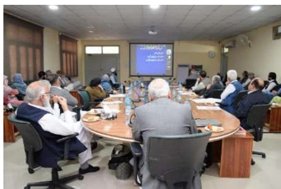
Zoom Seminar on Fasting & Health Issues