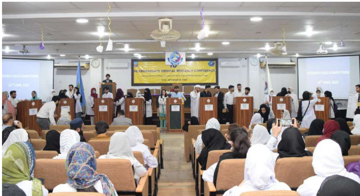
Students participating in quiz competition.