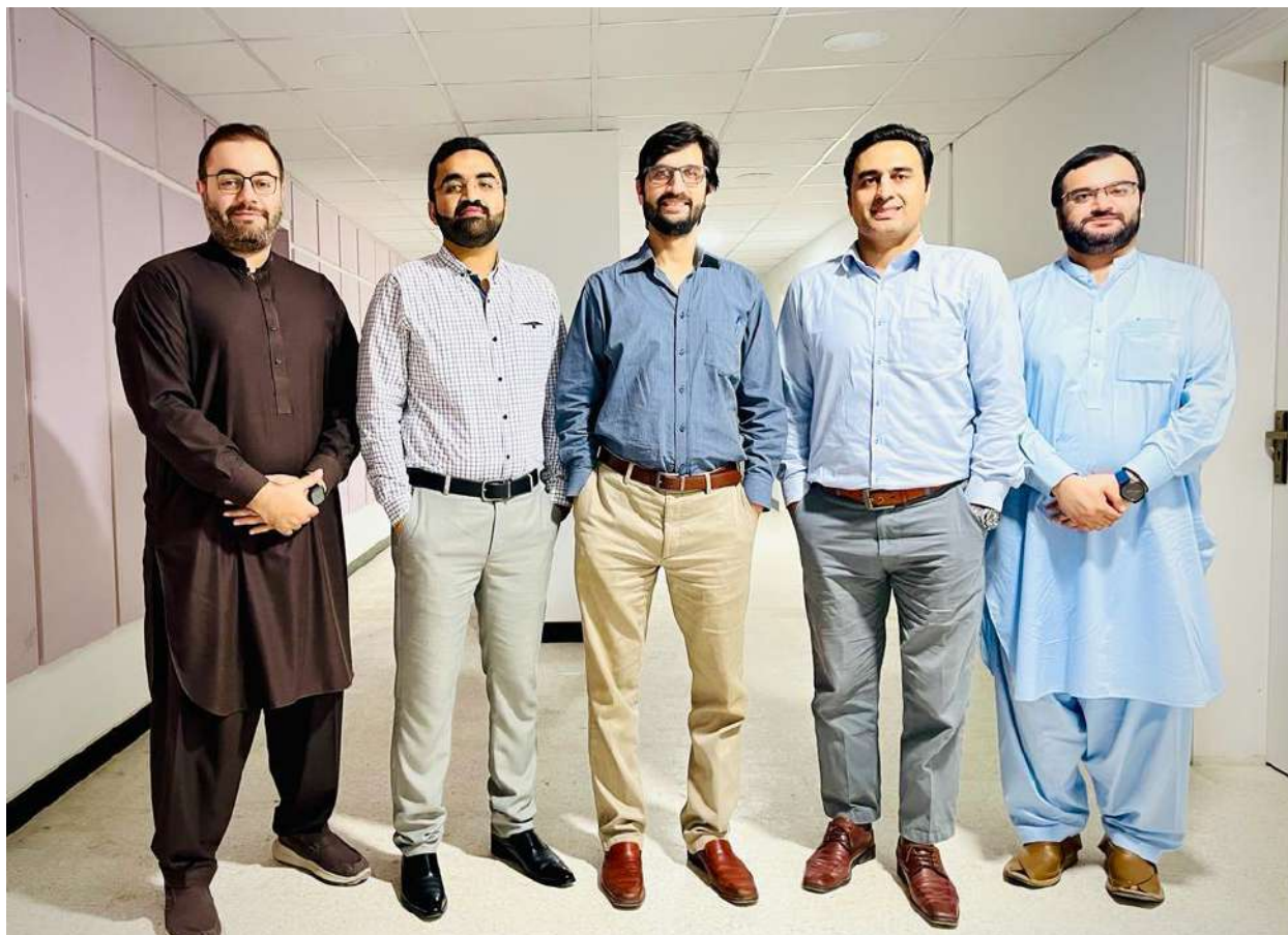
Team of experts of the Gastroenterology unit.

Prime Teaching Hospital's Gastroenterology unit is Khyber Pakhtunkhwa's fastest-growing unit. It has become a high-volume center for ERCPs and all diagnostic and therapeutic endoscopies. Recently, it introduced the first-ever bariatric endoscopy in the province's history. In addition, it is the only referral center in the province for argon plasma coagulation and endoscopic band ligation of hemorrhoids. The team's untiring efforts have made it one of the biggest referral centers in the province, giving the best 24/7 services in the concerned specialty.